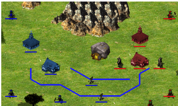
Figure 4: Real-time strategy game with isometric view.

Just like X3D, the engine is suitable for 2D games as well as 3D.