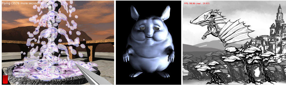
Figure 1: Screens from games done using Castle Game Engine

Michalis Kamburelis* Michalis Kamburelis Software