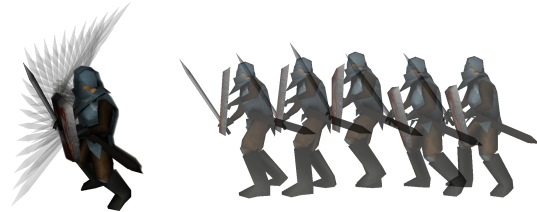
Figure 5: Animated knight walks and attacks.